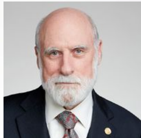
Vinton G. Cerf Google